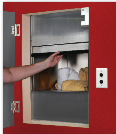
Easy-open, bi-parting car doors. Shown in optional Stainless Steel.