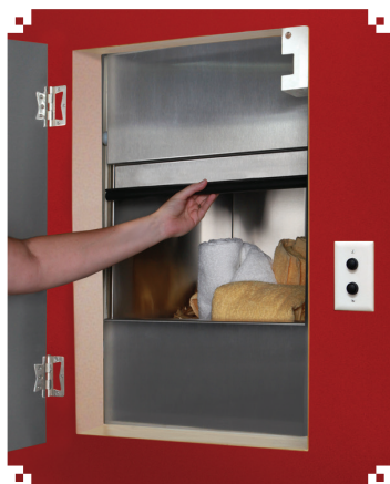
Shown in optional Stainless Steel finish