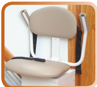
Optional Flip-Up Arms