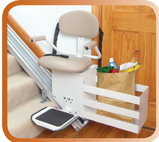
Optional Grocery Basket